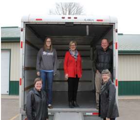
2015: Donation Van