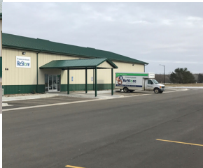
2018: Parking lot expansion