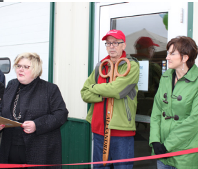
May 1, 2014: Grand Opening