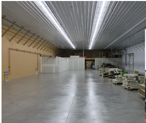
2012: Building purchased