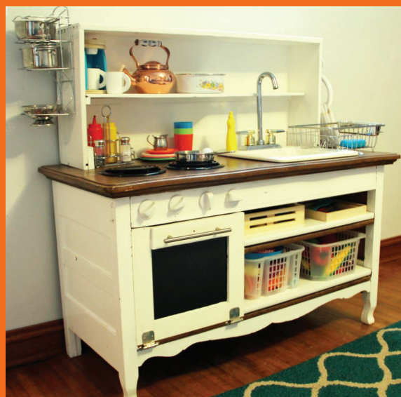
Finished and ready to cook up some fun!

For more inspiration, check out the examples on our website of projects created from ReStore materials at hfhdouglascounty.org/content/diy , and be sure to share your own DIY creations with us by emailing photos and project descriptions to restore@hfhdouglascounty.org .