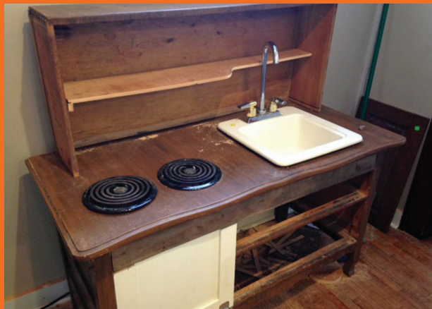
Work in progress!

The Habitat Douglas County ReStore is home to many items full of potential and possibility. Whether it's upcycling an old dresser, recovering an old chair or refinishing a table, be sure to shop the ReStore for your DIY needs!