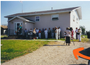
Pictured left: the first Habitat home from 1998!

Churches and faith groups across Douglas County will come together, putting love into action. We invite you to be part of this extraordinary build. Together, we'll raise walls, raise spirits, continue building homes — and brighter futures — one faithful step at a time. 100 homes strong. 100 homes built on faith. And we're just getting started.