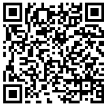
Alexandria Home - 2026 Legends Build