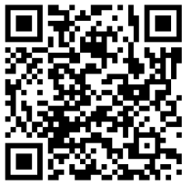
Alexandria - 100 th Home

To find a list of steps to take to contribute, visit our website at hfhdouglascounty.org/donate/mn-state-housing-tax-credit-program or scan one of the two QR codes to the right to go directly to the page for each of our projects. All the information you need to submit is listed right at your fingertips as well as listed below.