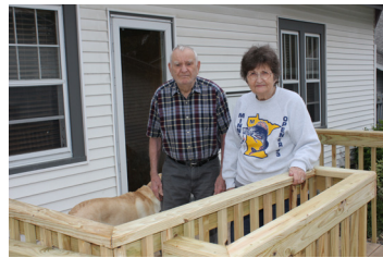
Building a ramp for accessible entry to the home