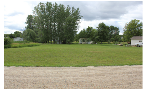
Getting ready to break ground on the next home.