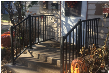
The first project, installing handrails to allow safe entrance to a house