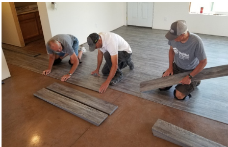
New flooring looks great!