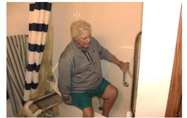
Placing grab bars, a handheld shower head and a sliding shower seat in the bathroom