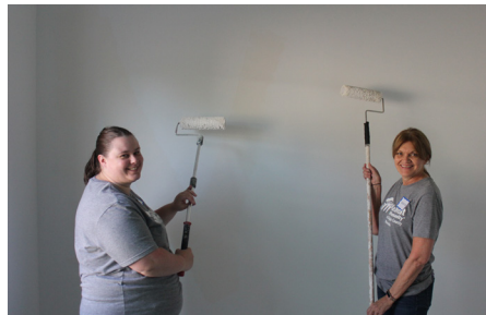
A fresh coat of paint looks amazing!