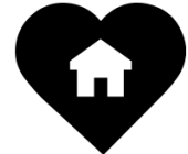
A home for a family