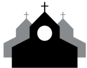
Multiple churches partner with Habitat

Our Faith Build is an opportunity to live out your church's ministry, engage your members, and see the miracle that occurs when God touches the hearts of new homeowners and the volunteers who work alongside them.