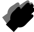
Prayer & support