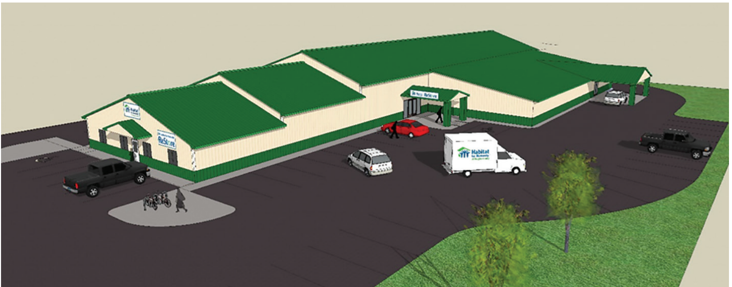
This preliminary architectural rendering from Ringdahl Architects shows what an expanded Habitat for Humanity facility could look like with expanded parking, ReStore retail and warehouse space.

“During our training evolution we also added a simulated fire through the use of smoke machines which added to the challenge. We also practiced critical communication skills needed to be successful. Overall the drill identified key areas where we needed to improve and that is why we train.”