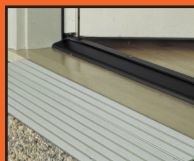
No-Step Door Threshold