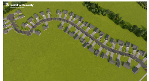
Above: birds eye view of entire development