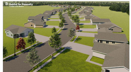
Above: view looking south from Scenic Heights Rd

Questions about the homeownership or Aging in Place programs? Please call the office at 320-762-4255