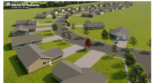
Above: view looking north from Summer Ln