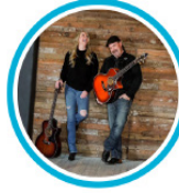
The Healers Featured Musicians